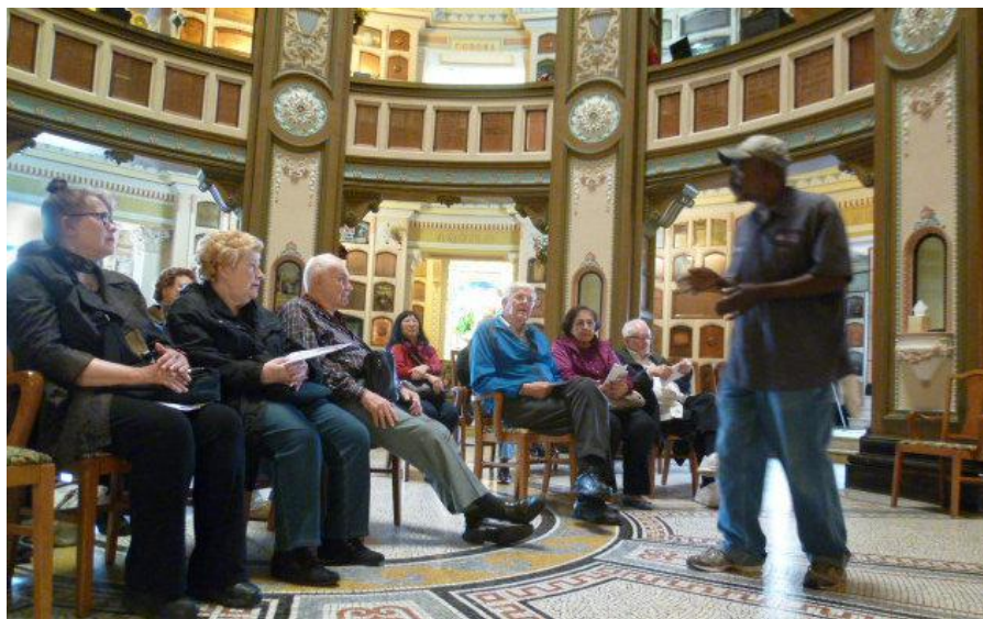
Sixty Plus members tour the Columbarium of San Francisco

Contact: Sheila Birmingham at sheilab507@hotmail.com