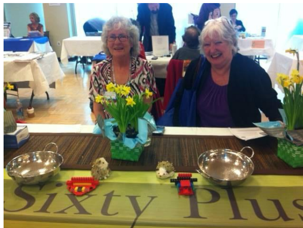
Art of Aging, Jewish Community Center of San Francisco, April 25, 2013