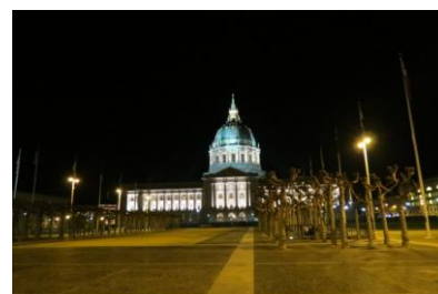
San Francisco City Hall Carlton B. Goodlett Place entry