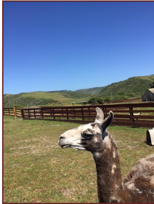
New four-legged friend