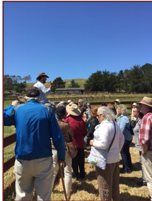
The group learns about rescue animals