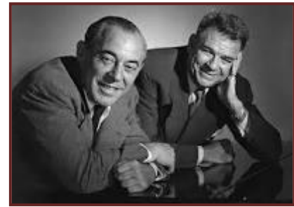
Left: Richard Rodgers right: Oscar Hammerstein

Together they wrote the scores for nine Broadway musicals including the groundbreaking "Oklahoma," "Carousel," "South Pacific," "The King and I," and "The Sound of Music." This one-hour presentation shows video clips of celebrated songs from these productions as well as a rare piece of footage featuring Rodgers and Hammerstein demonstrating how they wrote a hit song from "State Fair."