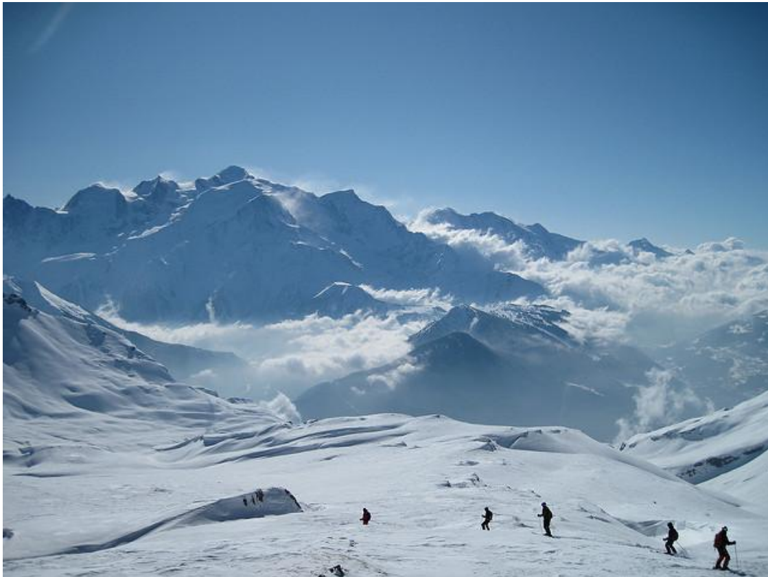
THE GLORIES OF THE SEASON