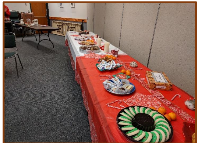
Holiday Treats (calorie-free!)