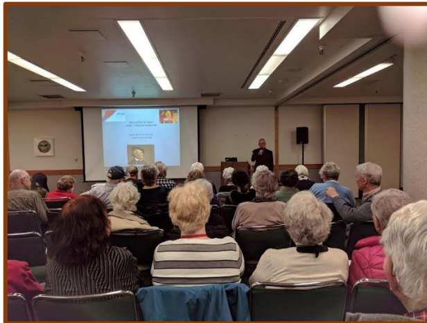
December Presentation on Wagner